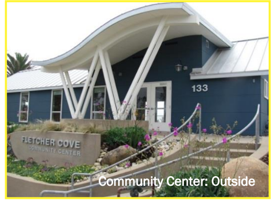
Community Center: Outside