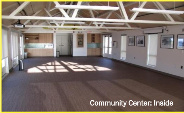
Community Center: Inside